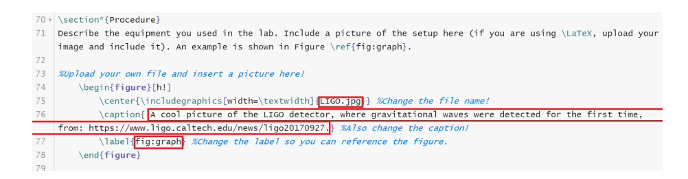
Figure 4: The Overleaf editing environment

You will need to insert an image of your lab setup, lab notebook, and graphs. To do this, copy and paste the lines (shown in Figure 4 below) in the lab template that produces the image of the LIGO detector. Replace the text in red boxes with your own text - the comments in blue should help you.